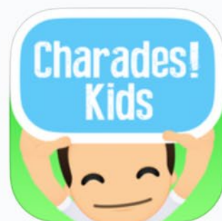
Charades! Kids (Free)