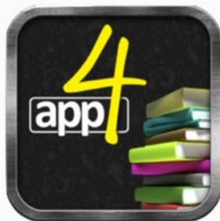
App4 Students (Free)