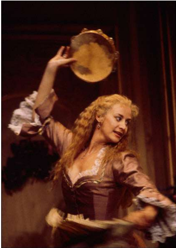
Janet McTeer as Nora in the 1997 Broadway Production

Nora's fancy dress for the party symbolizes the character she plays in her marriage to Torvald. Take note of when Nora is supposed to be wearing it and for whom. Note too that when she leaves Torvald in the last act, she first changes into different clothes, which suggests the new woman she is to become.