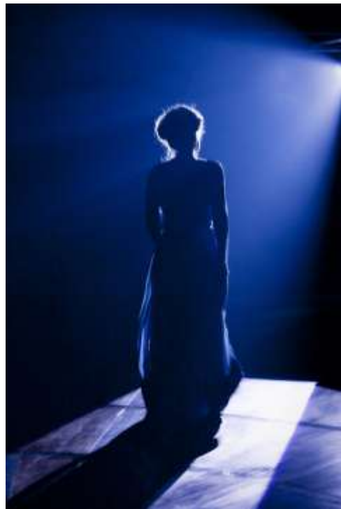
Gillian Anderson as Nora in the 2009 Donmar Warehouse Production

Both Nora and Torvald have a spiritual awakening, which could be seen as a rebirth. Nora's trials and tribulations wake her up to the pitiful state of her marriage. When the "wonderful thing" fails to happen, she realizes she'll never be a fully realized person until she severs herself from her husband. When she slams the door behind her, she is in a way reborn. Nora is not alone in her spiritual awakening, however. Torvald's last line, "The most wonderful thing of all?" seems to indicate that Nora's words haven't fallen on deaf ears. Torvald, like his wife, has realized the complete inadequacy of his existence. By the end of the play, both Helmers have been reborn.