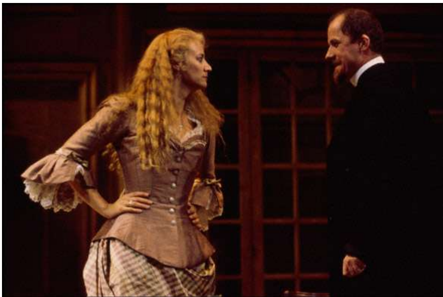
Janet McTeer as Nora and Peter Gowen as Krogstad in the 1997 Broadway Production