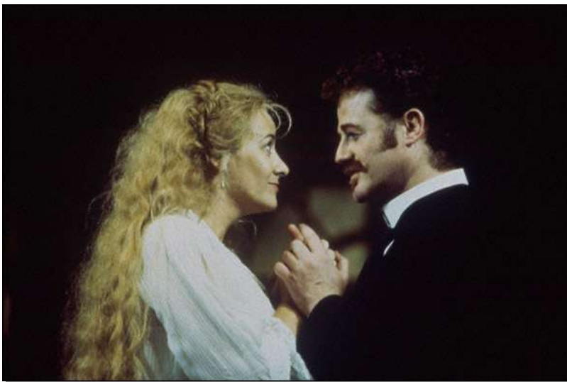
Janet McTeer as Nora and Owen Teale as Torvald in the 1997 Broadway Production

A close analysis of the dialogue shows a very unequal relationship with Torvald holding all the power. In fact, the interactions between husband and wife serve a specific purpose: they illustrate the banality of the discourse between the two. Torvald does not address his wife regarding any subject of substance. Instead, he bestows her with pet names that often begin with the personal pronoun “my” and often include the diminutive