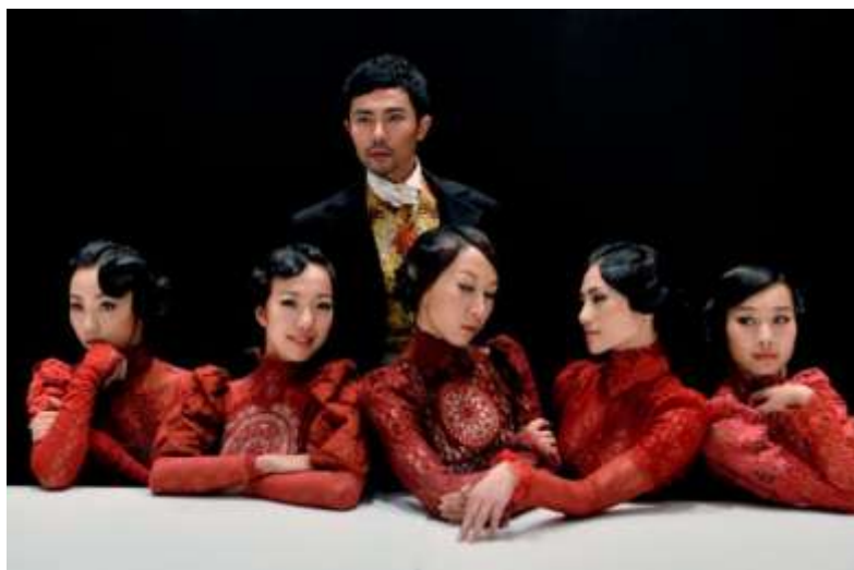
A Doll's House as a modern dance piece at the Capital Theatre Beijing in 2010

Ibsen's play has maintained its place in the popular repertoire and is regularly performed. Actresses such as Claire Bloom, Janet McTeer (who won a Tony Award for the role), Cheryl Campbell, and Tara Fitzgerald have portrayed Nora onstage. This has fast become one of the most coveted female roles in drama. Torvald, the play's second lead, it is probably fair to say, has attracted fewer first-rank actors.