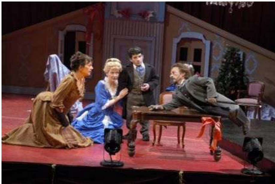
Lee Breur's production of A Doll's House at the Edinburgh Festival in 2007

There have been three major film versions. Patrick Garland's film stars Claire Bloom as Nora, Anthony Hopkins as Torvald, and Ralph Richardson as Dr. Rank. Joseph Losey's stars Jane Fonda and rather awkwardly depicts some of the events that occur before the play. A low-budget version by David Thacker looks dreadful in some ways but nevertheless contains a series of fine performances, not least from Trevor Eve as Torvald.