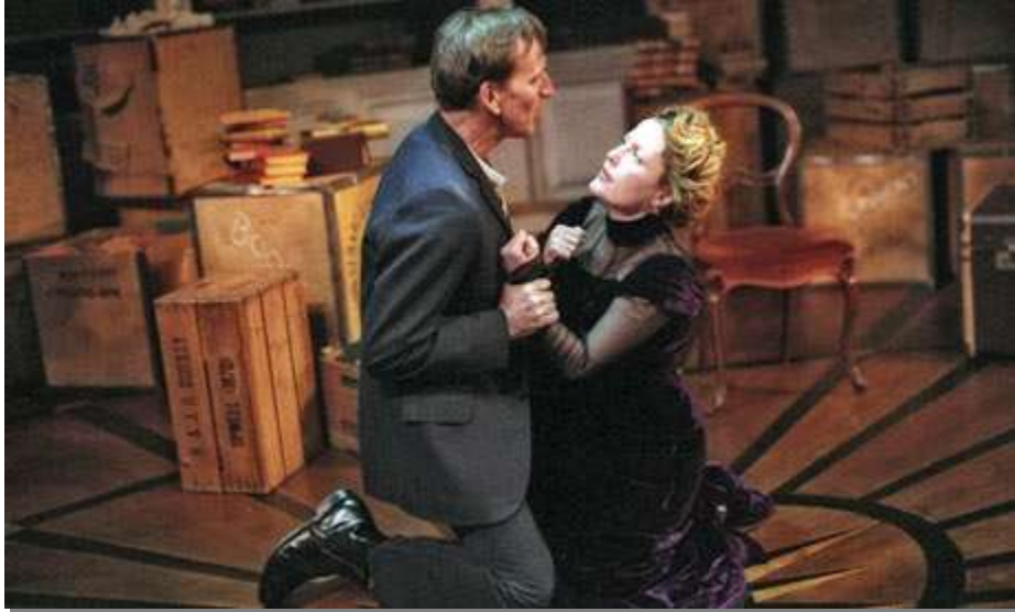
Gillian Anderson as Nora and Christopher Eccleston as Krogstad in the 2009 Donmar Warehouse Production