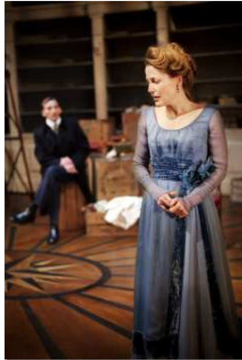
Gillian Anderson as Nora in the 2009 Donmar Warehouse Production, UK