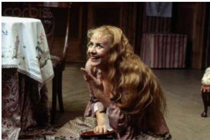
Janet McTeer as Nora in the 1997 Broadway Production

A Doll's House traces the awakening of Nora Helmer from her previously unexamined life of domestic, wifely comfort. Having been ruled her whole life by either her father or her husband Torvald, Nora finally comes to question the foundation of everything she has believed in once her marriage is put to the test.