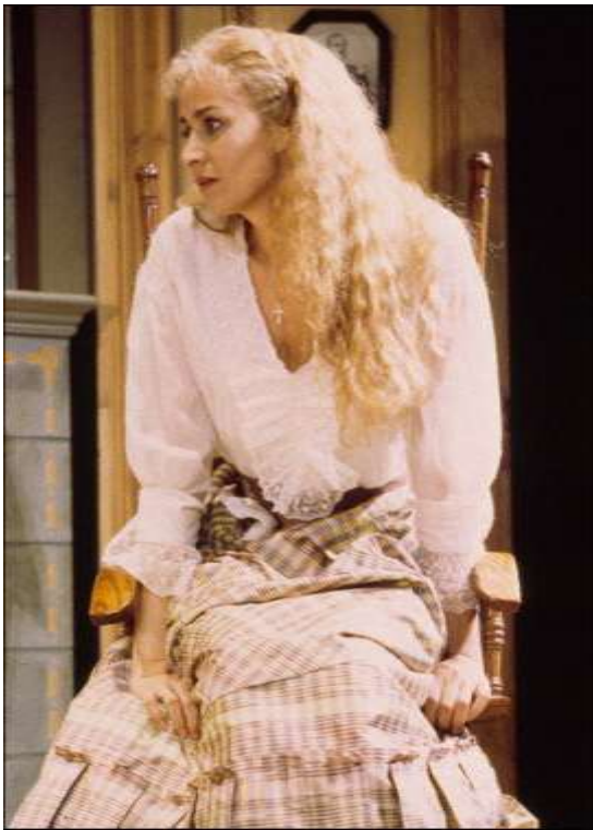
Janet McTeer as Nora in the 1997 Broadway Production

When Henrik Ibsen began writing his plays in 1850, he inspired an entire movement of theatre, one that scholars consider to be the beginnings of modernism in theatre; this movement is called Realism. Realism often touched on the parts of life that could be considered ugly or distasteful; topics that included things that Victorian society rarely spoke of in the privacy of their own homes, let alone in the public setting of the theatre. Henrik Ibsen embraced this view wholeheartedly and wrote all of his plays to include subject matter deemed largely inappropriate by many theatre-goers.