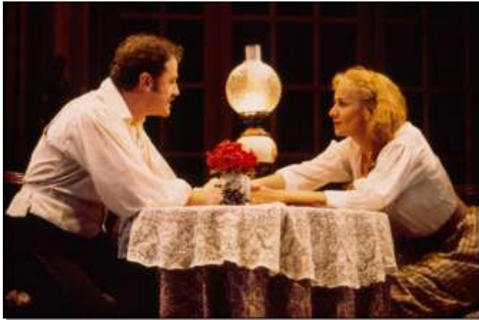
Janet McTeer as Nora and Owen Teale as Torvald in the 1997 Broadway Production

The next night, before Torvald and Nora return from the ball, Mrs. Linde and Krogstad, who are old lovers, reunite in the Helmers' living room. Mrs. Linde asks to take care of Krogstad and his children and to help him become the better man that he knows he is capable of becoming. The Helmers return from the ball as Mrs. Linde is leaving (Krogstad has already left), with Torvald nearly dragging Nora into the room. Alone,