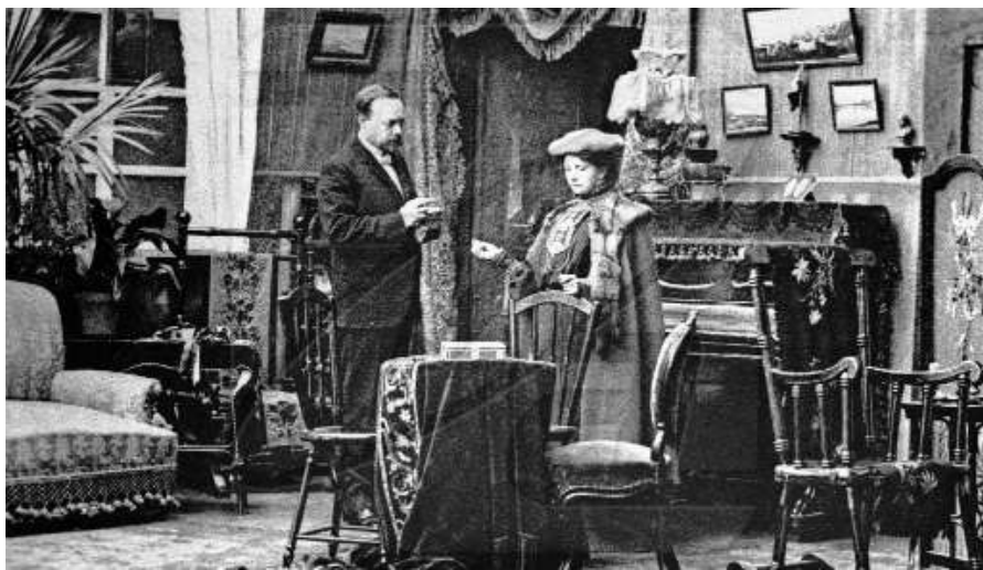
World premiere of A Doll's House at the Royal Theatre in Copenhagen 1879