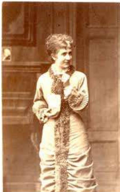
Betty Hennings as Nora in the world premiere at the Royal Theatre in Copenhagen, 1879

The world premiere of A Doll's House took place at the Royal Theatre in Copenhagen on December 21, 1879. The premiere date was fitting for the Christmastime setting of the play. Two weeks earlier, a print run of 8,000 copies of the script had been published, and it already had sold out. Some critics likely had read the text well in advance of the production. The production, largely naturalistic, retained a symmetrical arrangement of furniture along the walls, giving perhaps a slightly abstracted feel. Betty Hennings was the first Nora, and the production was directed by H. P. Holst.