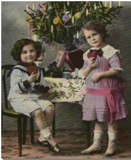
Vintage Norwegian Christmas card