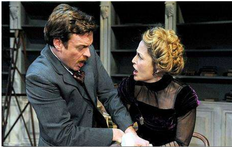
Gillian Anderson and Toby Stevens as Torvald in the the 2009 Donmar Warehouse Production

As she is leaving, though, Torvald stops her. He has just read Krogstad's letter and is enraged by its contents. He accuses Nora of ruining his life. He essentially tells her that he plans on forsaking her, contrary to his earlier claim that he would take on everything himself. During his tirade, he is interrupted by the maid bearing another note from Krogstad and addressed to Nora. Torvald reads it and becomes overjoyed. Krogstad has had a change of heart and has sent back the bond. Torvald quickly tells Nora that it is all over after all: he has forgiven her, and her pathetic attempt to help him has only made her more endearing than ever.